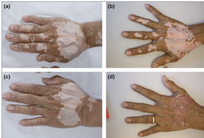
Fig 2. (a, b) Vitiligo lesions on the right hand before treatment (a) and 1 month after treatment with topical steroids and narrowband ultraviolet B (NB-UVB) (b). Note some repigmentation, but the result is not aesthetically satisfying. (c, d) Left hand before treatment (c) and 1 month after laser-assisted dermabrasion followed by topical steroids and NB-UVB (d). The repigmentation is almost complete but a hypertrophic scar has developed.